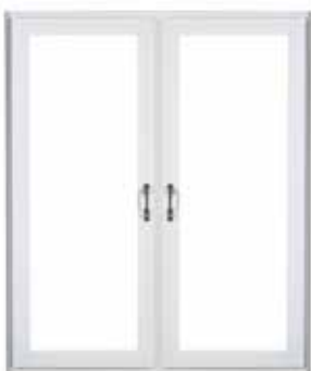
Terrace door with central mullion (option of hinges on the exterior walls or on the mullion)