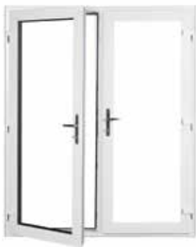
Fully opening French door (hinges on the sides and astragal)